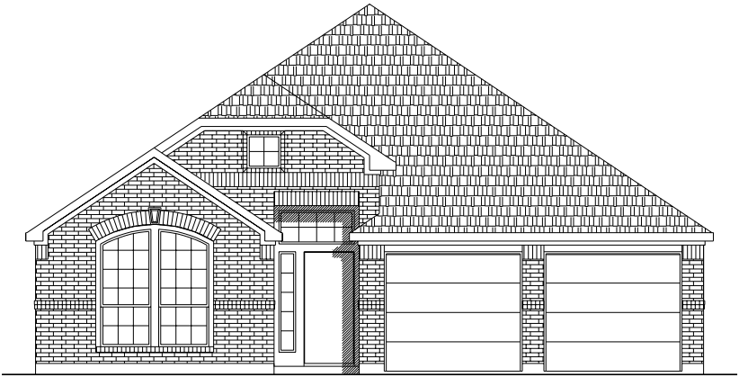
PLAN 2267W E-2