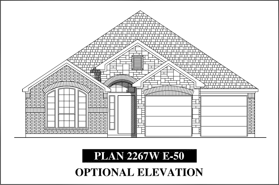
PLAN 2267W E-50 OPTIONAL ELEVATION