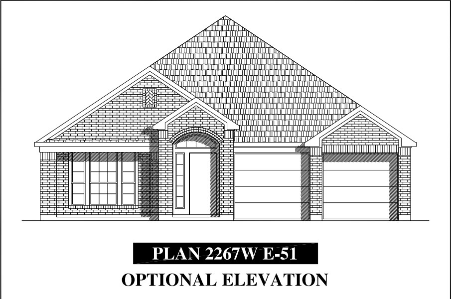
PLAN 2267W E-51 OPTIONAL ELEVATION