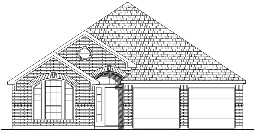
PLAN 2267W E-1

Some of the elevations shown may not be available in all communities.